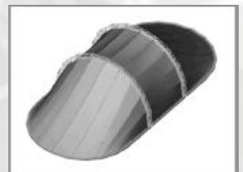
Complete in 6 hours